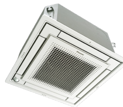
Shown with panel BYFQ60C2W1W

This system directs warm air to the floor in winter and cool air across the room in summer for optimal efficiency and comfort. The large flap governs airflow direction while the small flap (or diffuser) swings, producing fine air currents that help circulate the air around the room.