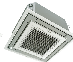
Shown with panel BYFQ60C2W1S